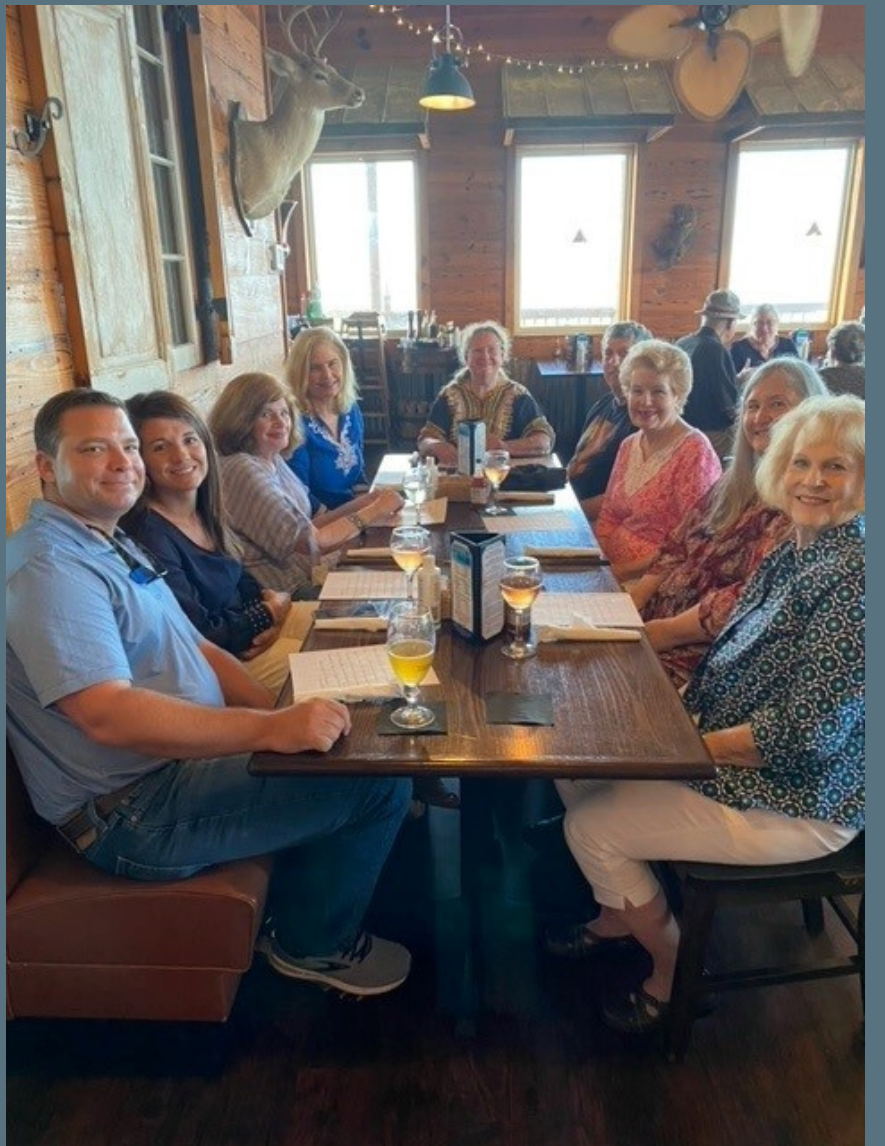
Frenier Landing Restaurant