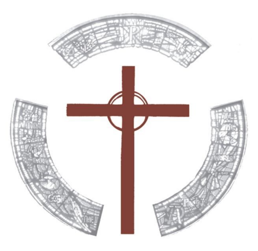
"Freed by the Fire, Renewed by the Flood, and Empowered by the Spirit"