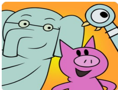
Session 3: Elephant and Piggie Go to Camp June 17th—21st