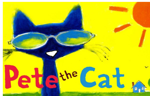
Session 4: Pete the Cat at Summer Camp July 8th—12th

Join us for four fun-filled weeks this summer as we learn about fun places and meet new friends! This year, we will be visiting with some of our favorite authors and book characters. So don't miss out, sign up now!