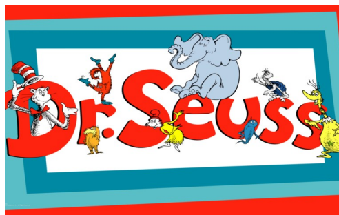
Session 2: Dr. Seuss Week June 10th—14th